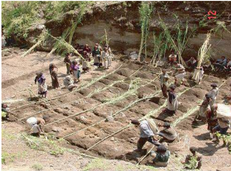
Photo 2: Planting of elephant grass by layering to rehabilitate gully bed

Layering is the horizontal planting of fresh stems of plants (e.g. elephant and bana grass, green gold, spanish reed, elderberry, poplar, willow) across the gully floor and/or reshaped sidewall, or at the base of gully walls. This technique is applied when a satisfactory level of sedimentation has been achieved. The stems of these plants root very easily and initiate shoot quickly. Sedimentation increased as the shoot growth forms a dense barrier that checks and breaks the flow of water. This in turn leads to a gradual build-up of the gully floor/bed as a result of siltation.