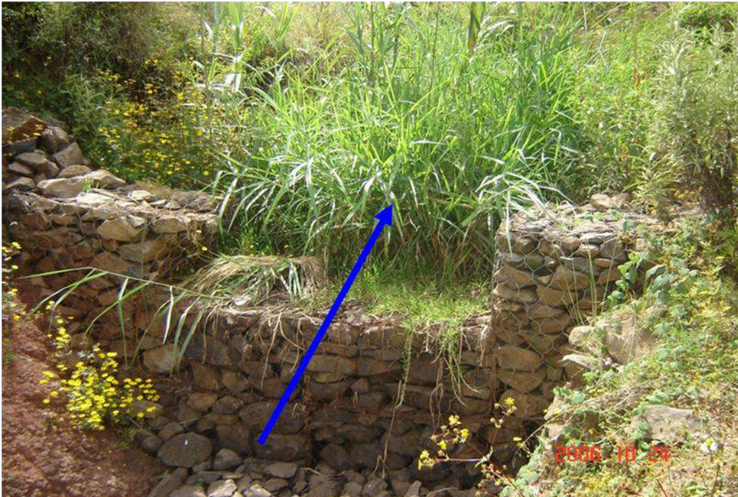
Green gold behind the Gabion checkdam