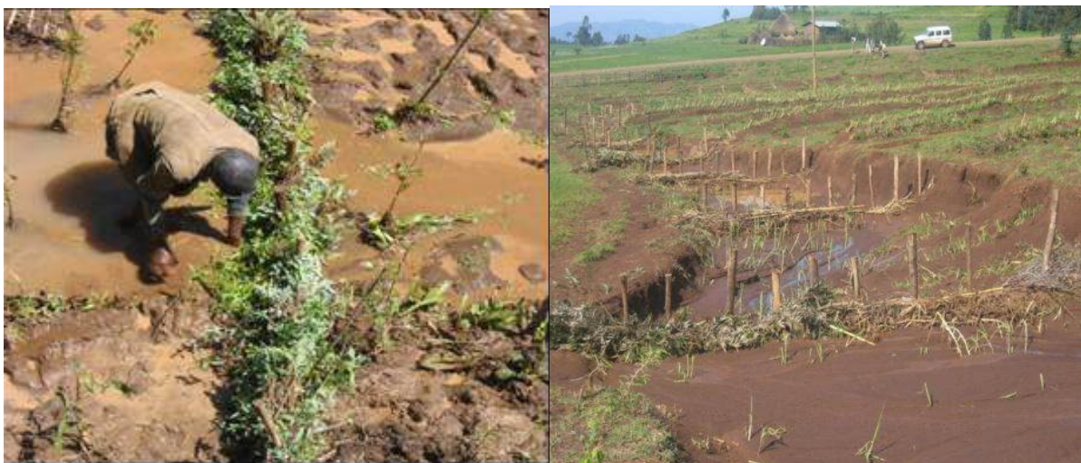
Photo 1: Sample photos on biological gully rehabilitation practices using wattle techniques

Reinforced bundling requires that mature poplar or willow stems or truncheons (branches), 70 cm in length, are inserted 20 cm deep next to each other across the gully floor or bed in two rows, spaced 50 cm apart. Downstream buttressing (support) should be provided for stability. The space between the two rows of truncheons should then be filled with bundles consisting of approximately 30% vegetative (fresh) bundles of planting material, and 70% of filling material. Withering of the planting material can be prevented by lightly covering the material with moist soil. As soon as the poplar or willow stems have exhibited adequate vertical growth, the space between the stems can again be filled with bundling material. There will thus be an incremental growth in the height of the structure, which will in turn add to the level and amount of siltation. This technique should only be applied when the rainy season has commenced. Through time, the bundles grow and serve as live check dams (photo 1). Bundles of willow, poplar, green gold, bana and elephant grass species are simple and effective means's to control small sized gullies.